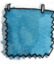
ROYAL BLUE COTTON